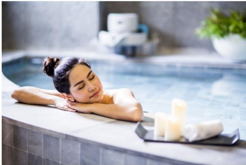
X2 Vibe Bangkok Sukhumvit launches YAN SPA

February 22, 2018 Africa, America, Asia, Australia, Europe, Hospitality News, India, Middle East, New Zealand No comments